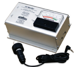
UV Monitor (Part # 4-UV/MS-1/2 V3)

- For those applications that require fail-safe operation, a monitoring system can be added. This consists of a sensor that measures the intensity of the UV light in realtime, and displays it on a meter face on the monitor. In case the intensity goes below the recommended dosage for drinking water, the monitor can trigger a solenoid valve to shut off the flow of water until the problem has been rectified.